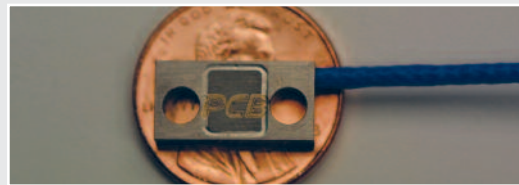
FIGURE 2: PCB 3991 High Shock MEMS Accelerometer

The next needed step in high-G MEMS shock sensing technology was apparent; it required the inclusion of damping. The challenge has been that damping requires energy dissipation, which is in turn dependent on motion. High-G MEMS accelerometers typically have mass motion from nanometers to microns. Previously, this small amount of motion has precluded the achievement of any significant damping. In the past year, advanced MEMS processing technology has enabled control of dimensional tolerances so that this next step has occurred. Robert Sill, an experienced PCB designer, along with PCB MEMS process engineers at the University of Washington, has evolved the Model 3991 (Figure 2) in ranges to 60,000 G 4 . Film damping has reduced the “Q” of MEMS accelerometers at resonance to 10:1 (factor of 100 improvement). The inclusion of mechanical stops has also been achieved. This “ruggedization” has occurred concurrent with increased measurement demands in pyroshock and ballistic shock as well as requirements for the fuzing of smart weapons. The next advancement in high-G shock measurement may again be years away, but it will certainly involve MEMS technology.